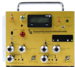
LAM-10DSC Electronics SSS-22P-