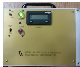
LAM-10D Electronics SSS-12P-1