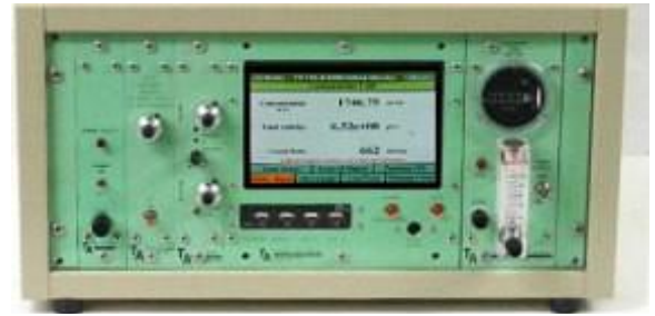
MCA-TA MULTICHANNEL ANALYZER ELECTRONICS