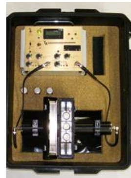
SSS-22PAL Suitcase Version ALL-IN-ONE