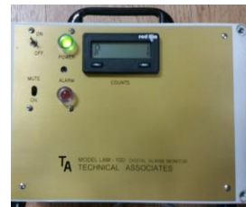
LAM-10D Electronics SSS-12P-1