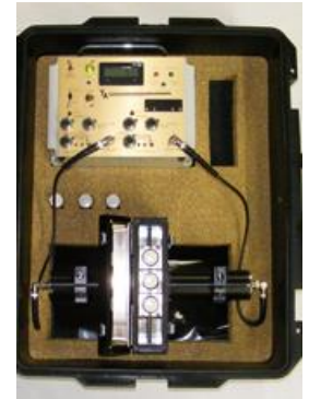
SSS-22PAL Suitcase Version ALL-IN-ONE