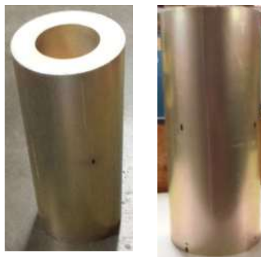
PGS-9000 - 1 LITER LARGE VOLUME SCINTILLATION DETECTOR