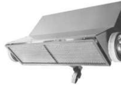
AFBM-SERIES FLOOR MONITORS FABM 系列监测仪