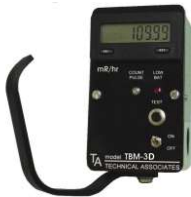
TBM-3-D ELECTRONICS TMB 电子学