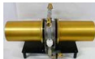
NEX-ABG-9TT DUAL DETECTOR ASSEMBLY 双探头组件系统