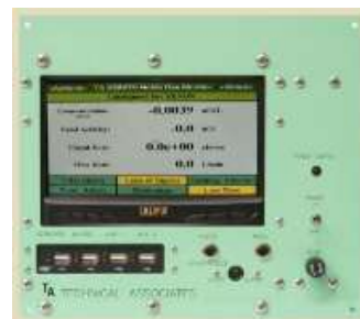
NEX-ABG-9TT ELECTRONICS 电子学部分