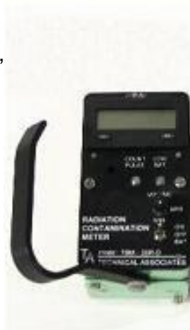
AIR TBM (e)