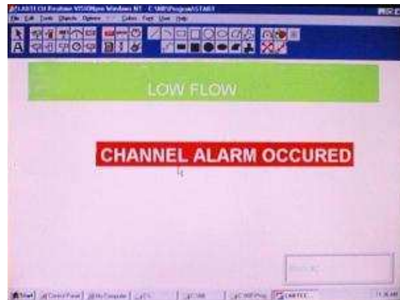
TYPICAL DISPLAY SCREENS

TA TECHNICAL ASSOCIATES 7051 ETON AVENUE * CANOGA PARK, CA 91303 TELEPHONE (818) 883-7043 * FAX(818) 883-6103