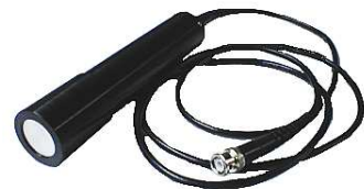
Figure 1: FS-5T(Top); PGS-3L(Bottom)