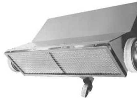
Figure 1: ABFM-Series

GENERAL DESCRIPTION: Alpha plus Beta Gamma Floor Monitors, Models ABFM-5, 6, & 7 utilize alpha-beta-gamma sensitive detectors coupled to appropriate electronics. An electronic sorter accepts and displays alpha counts only or alphas plus beta-gamma, or beta-gamma only. Windows are protected by a frame and grid which may be easily removed for decontamination purposes. The very large face detectors achieve, as far as we know, the fastest most sensitive floor monitoring system currently available.